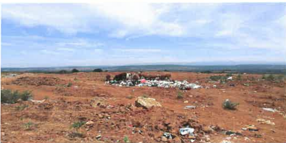
Photo.1: because of lack of grazing in the veld cattle are feeding themselves on the dumping sites